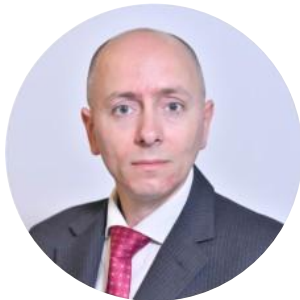
Vincenzo Capizzi Venture Capital: An International Journal of Entrepreneurial Finance